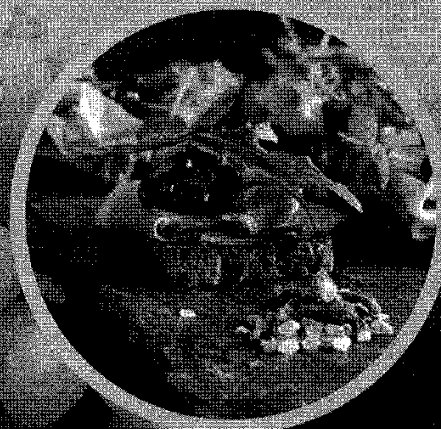
Decadent Dessert Table

Non-alcoholic beverages and vegetarian options provided